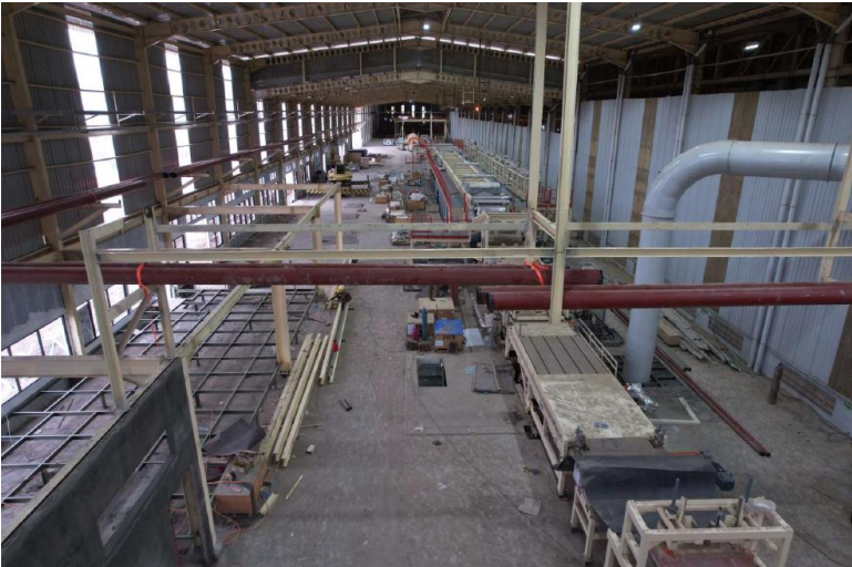
MDF – Press Station