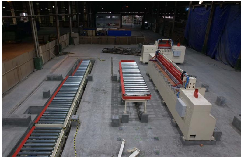
MDF – Cut to Size