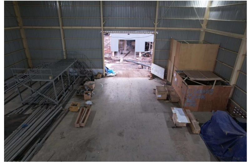
Refiner Area – on progress Glue Kitchen