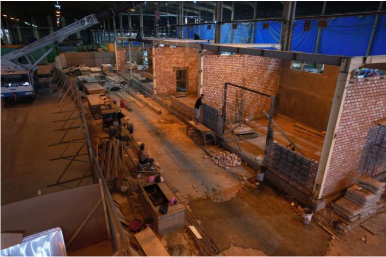
MCC Room Cut to Size