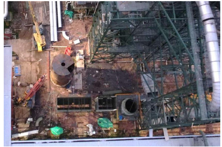
Pneumatic structure and erection dust silo