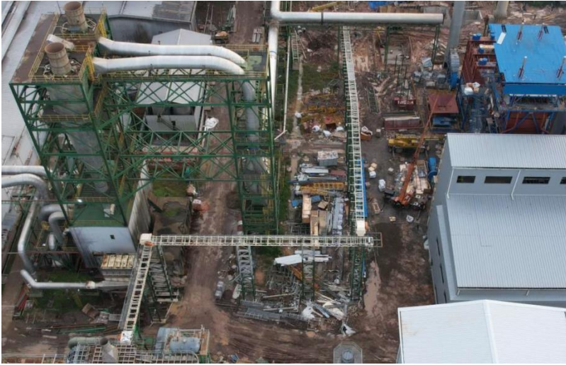
Conveyor wet fuel – energy plant