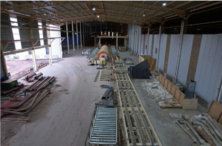
MDF – Rawboard Handling