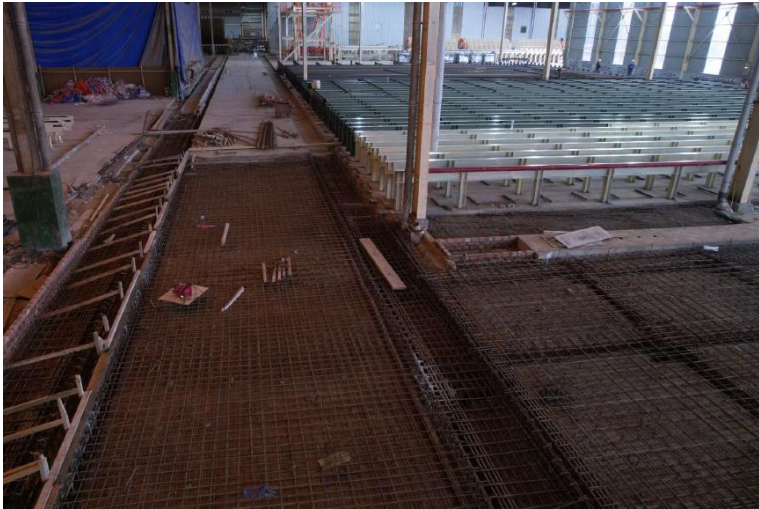
MDF – Rawboard Storage