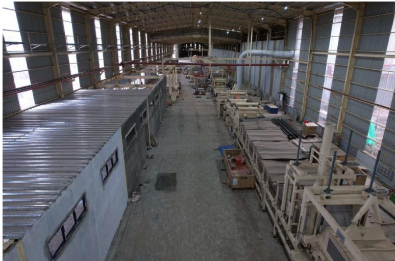
MDF – Forming to Press Station