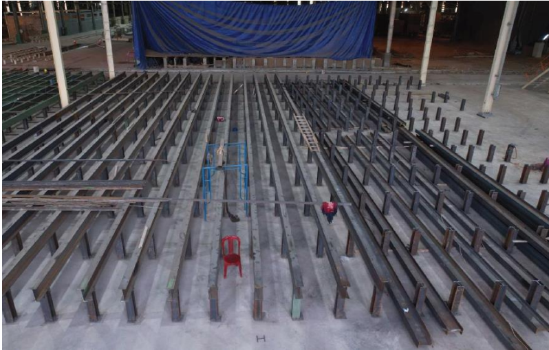
MDF – Rawboard Storage