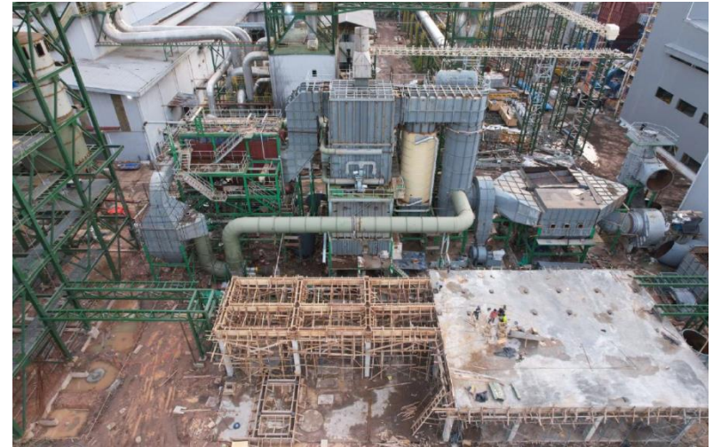
Energy Plant (EP) & MCC Room EP