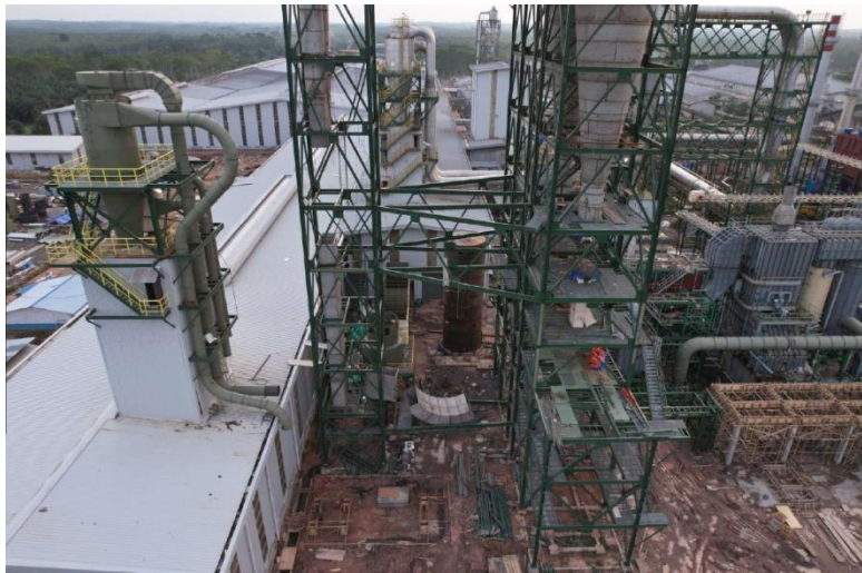
MDF – Forming Line to Drier