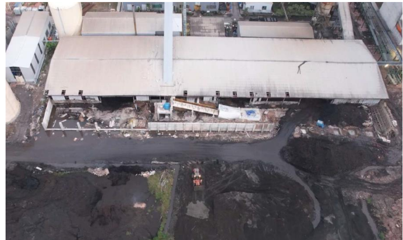
Coal Handling System