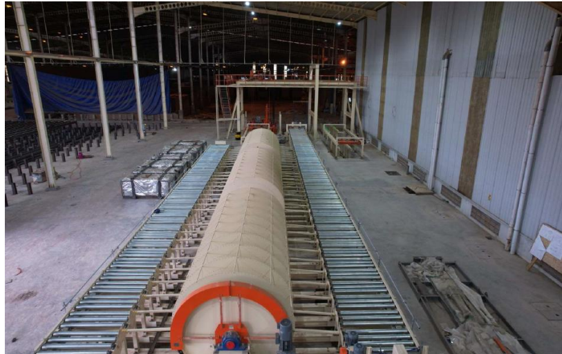
MDF – Rawboard Handling