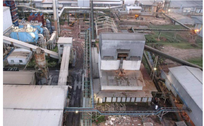
Barker - Conveyor