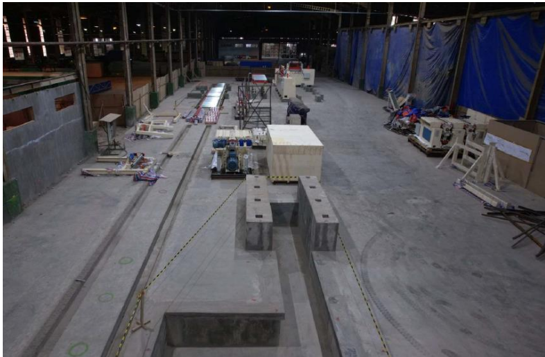
MDF – Cut to Size