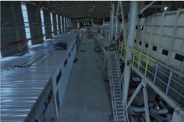
MDF – Forming Line with MCC Room Forming