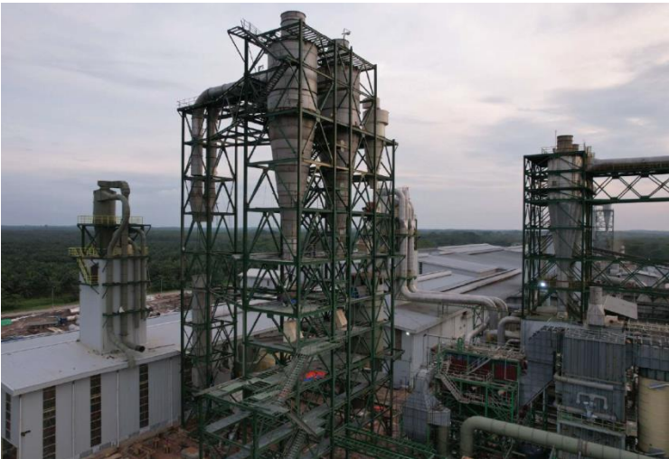
Drier Shifter Vertical